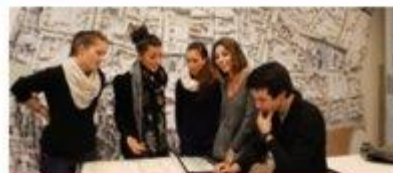
Gender and Education