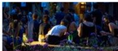
Education and Commons: Cities, Territories, Heritage, Citizenship