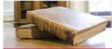
Construction of Knowledge: Paradigms, Methodology and Instruments in Educational Research