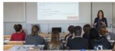
Teaching and Education: Contexts and Practises in Formal Education