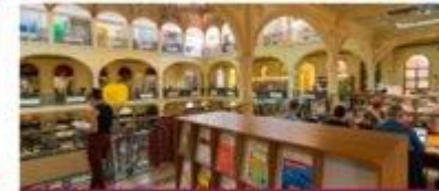
Education and Socialization: Theory and Models in Formal and Non-Formal Educational Contexts