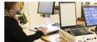
Inclusive Processes, Forms of Marginality and (New) Social Scenarios