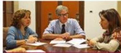
Professional Themes for Education