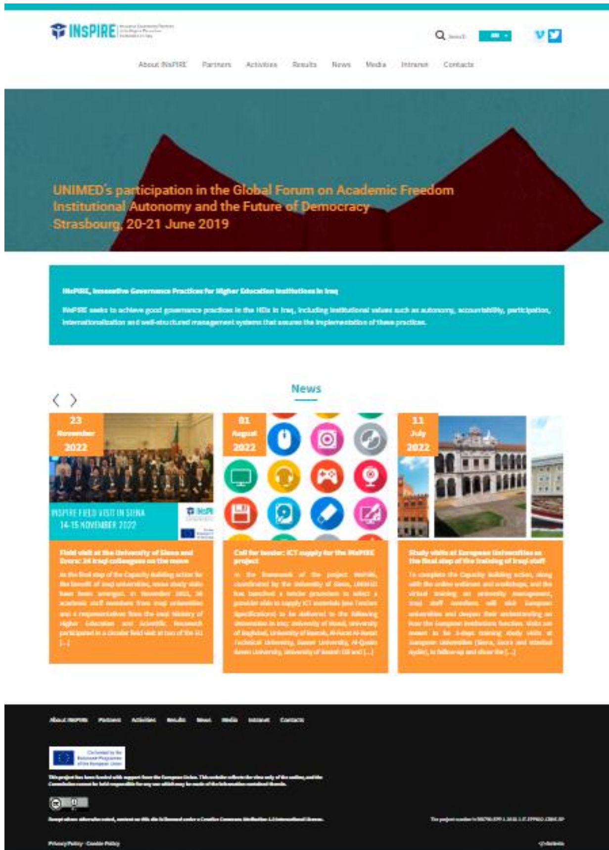
Fig. 1: Homepage of the INsPIRE website